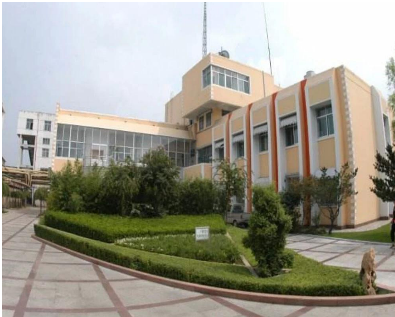
Factory staff □