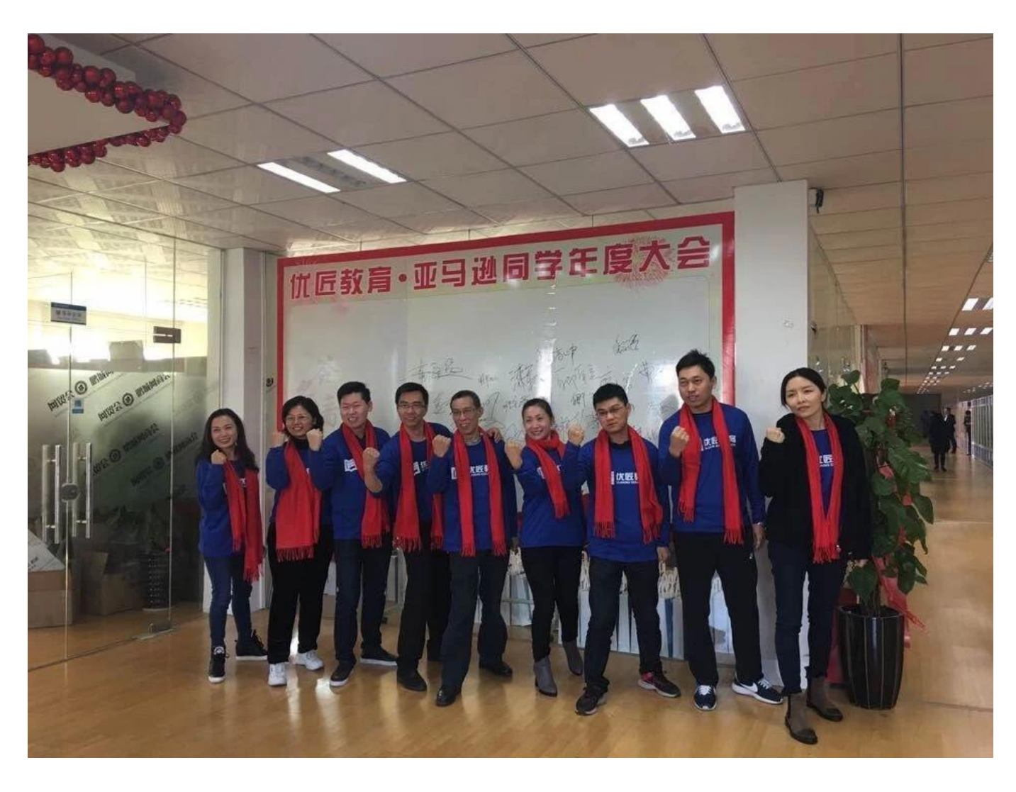
Excellent staff photo