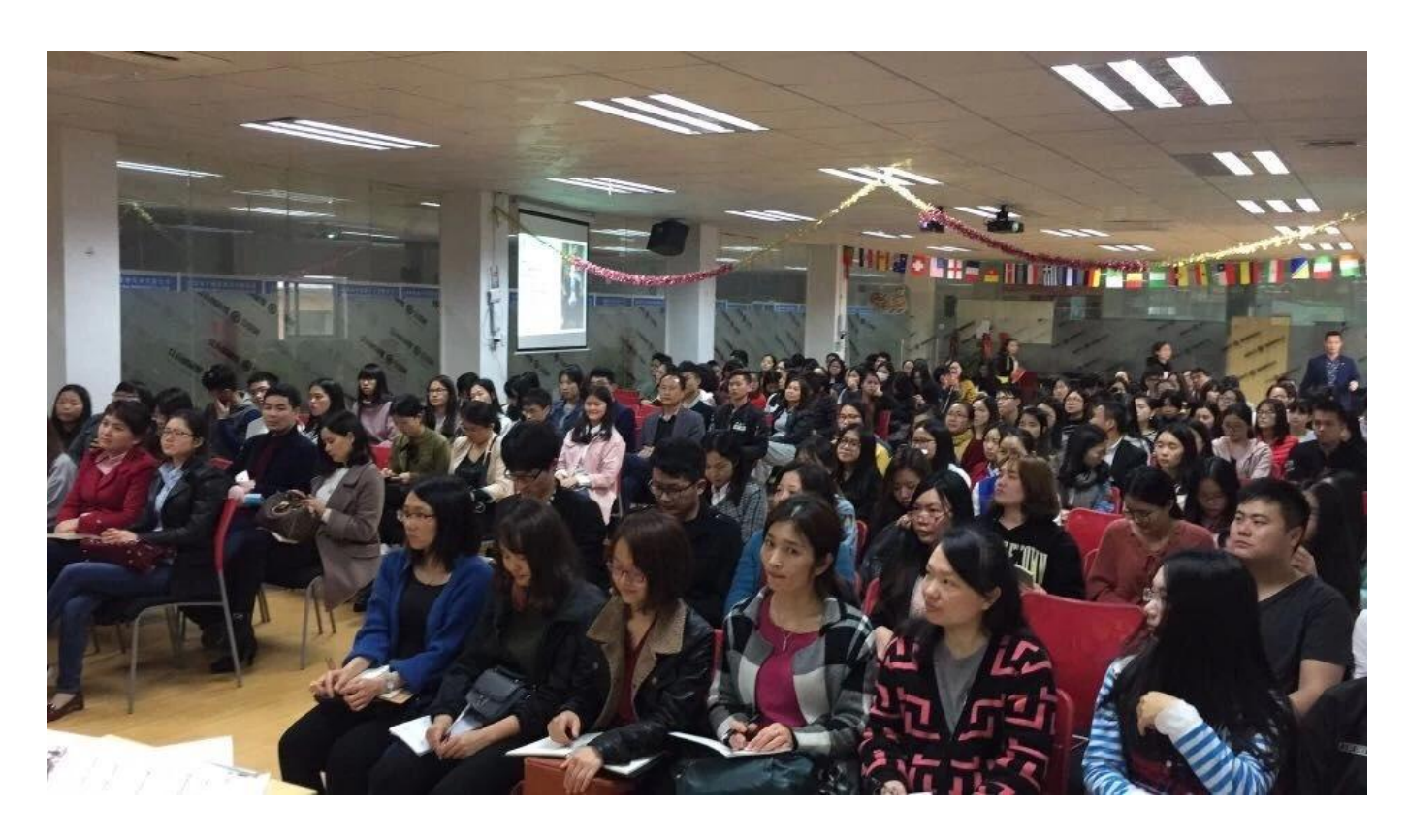
Office clerk temperament training