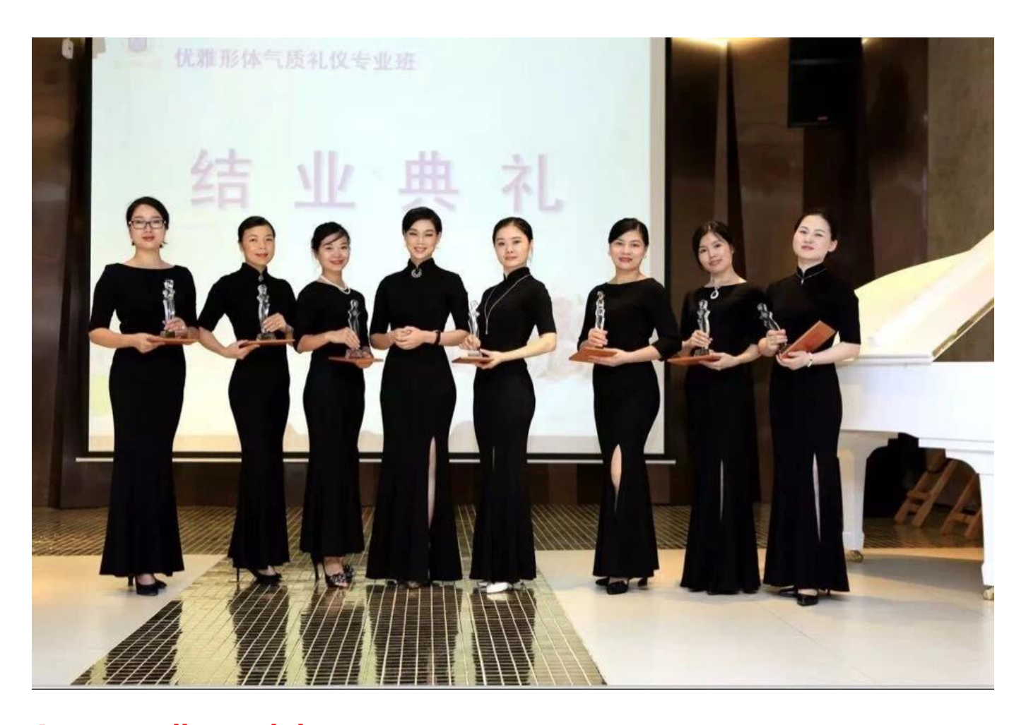
Amazon elite training[]