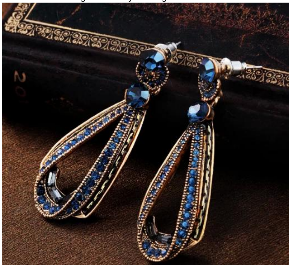
2018 fashion vintage zinc alloy earrings woman