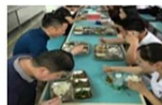
Factory workers military exercises and entertainment