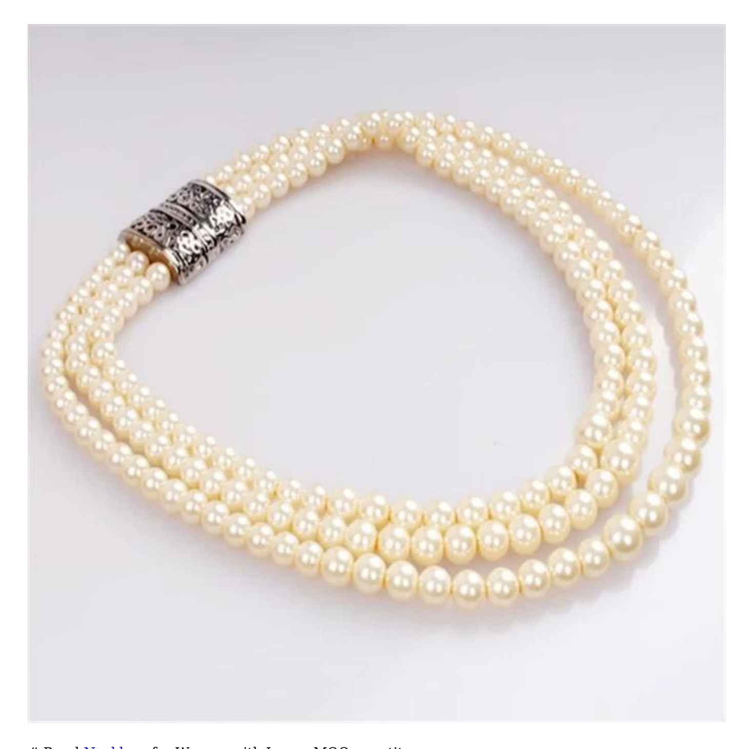
# Pearl Necklace for Women with Lower MOQ quantity.