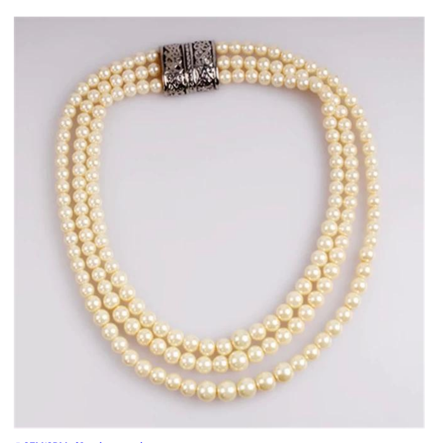
# OEM/ODM of Jewelry are welcome.