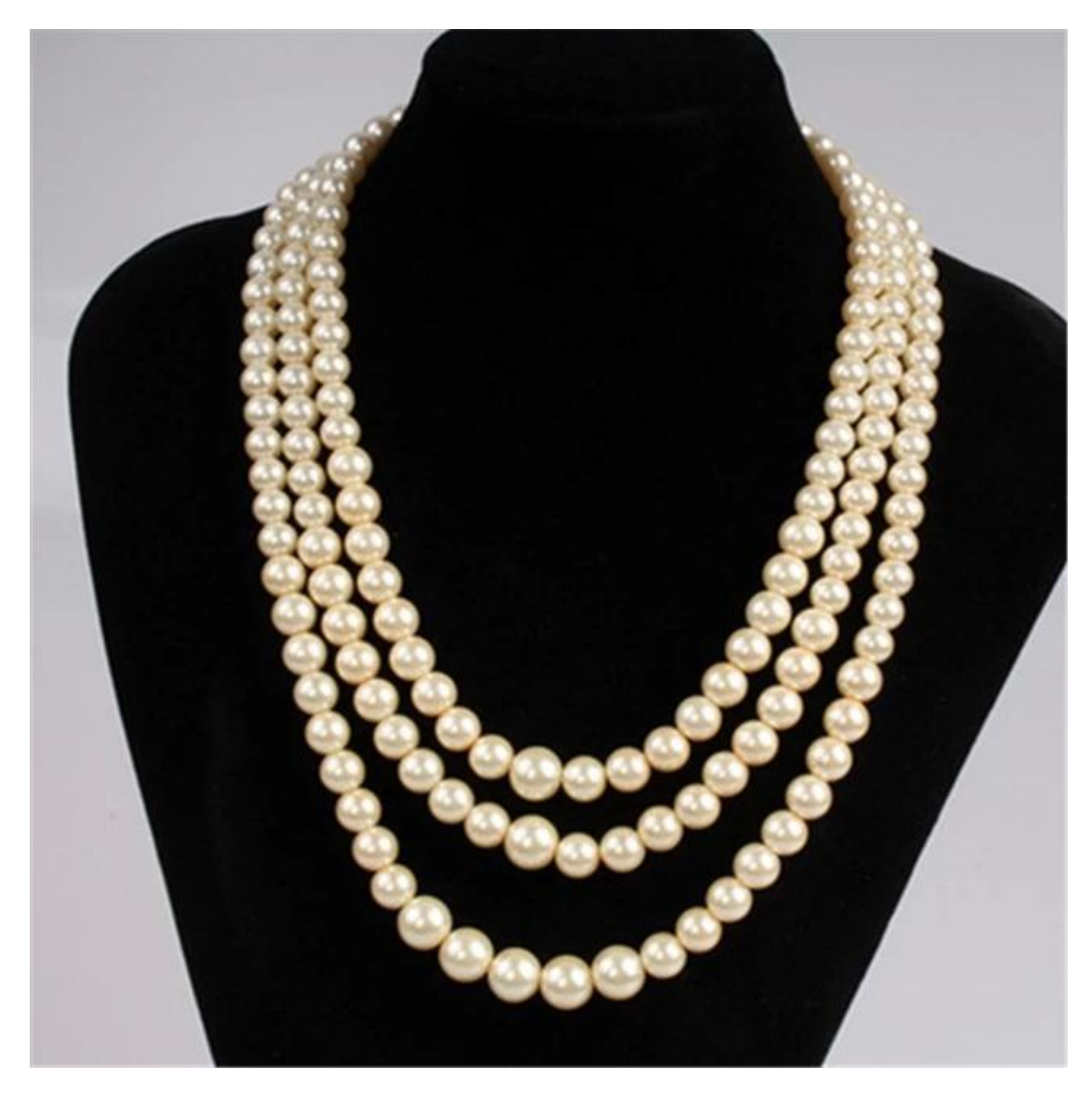
# More detail about Necklaces.