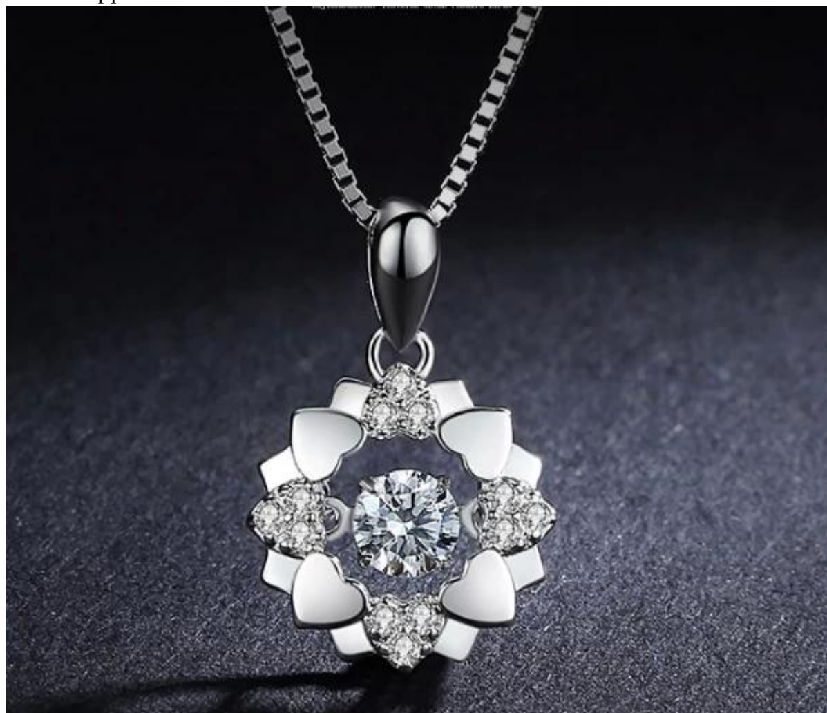
China Supplier 925 Silver Gemstone Necklace for Woman