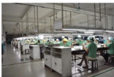
Color Filled in