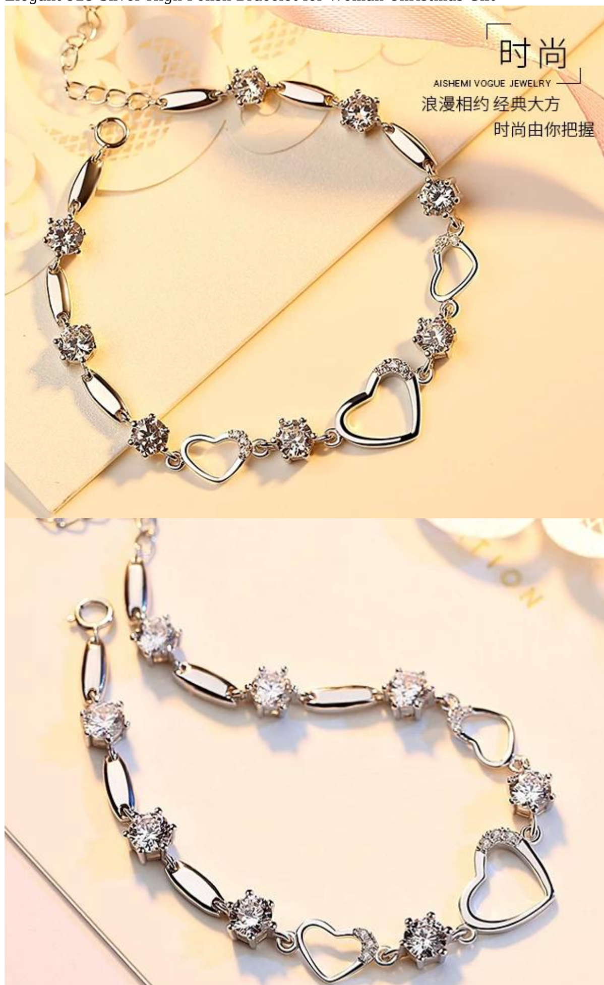
Elegant 925 Silver High Polish Bracelet for Woman Christmas Gift