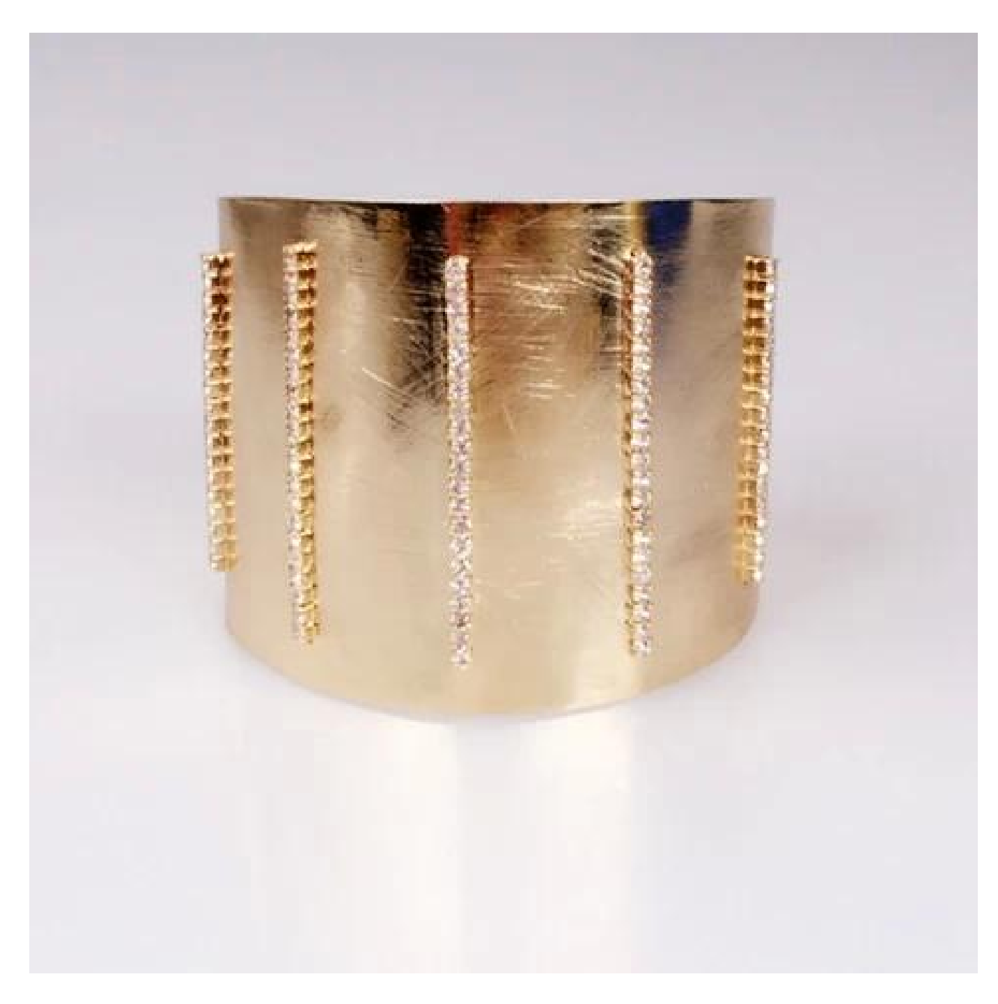
# Bracelet Jewelry making supplies.