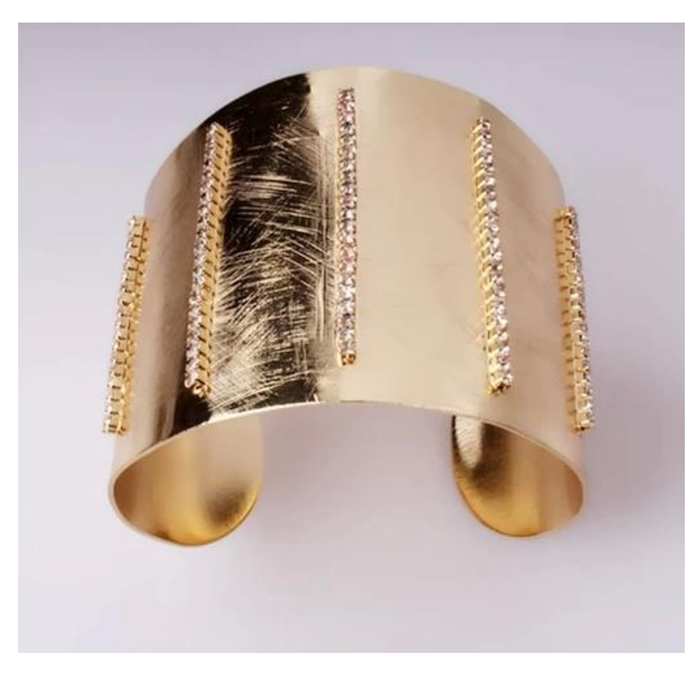
# Jewerly accessorie for Party, Wedding.