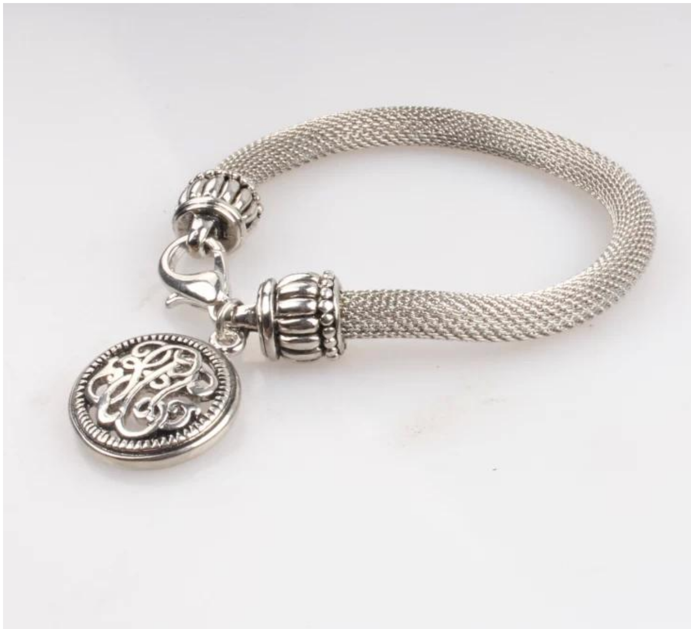
# Fashion Jewelry European bracelet for Wemen.