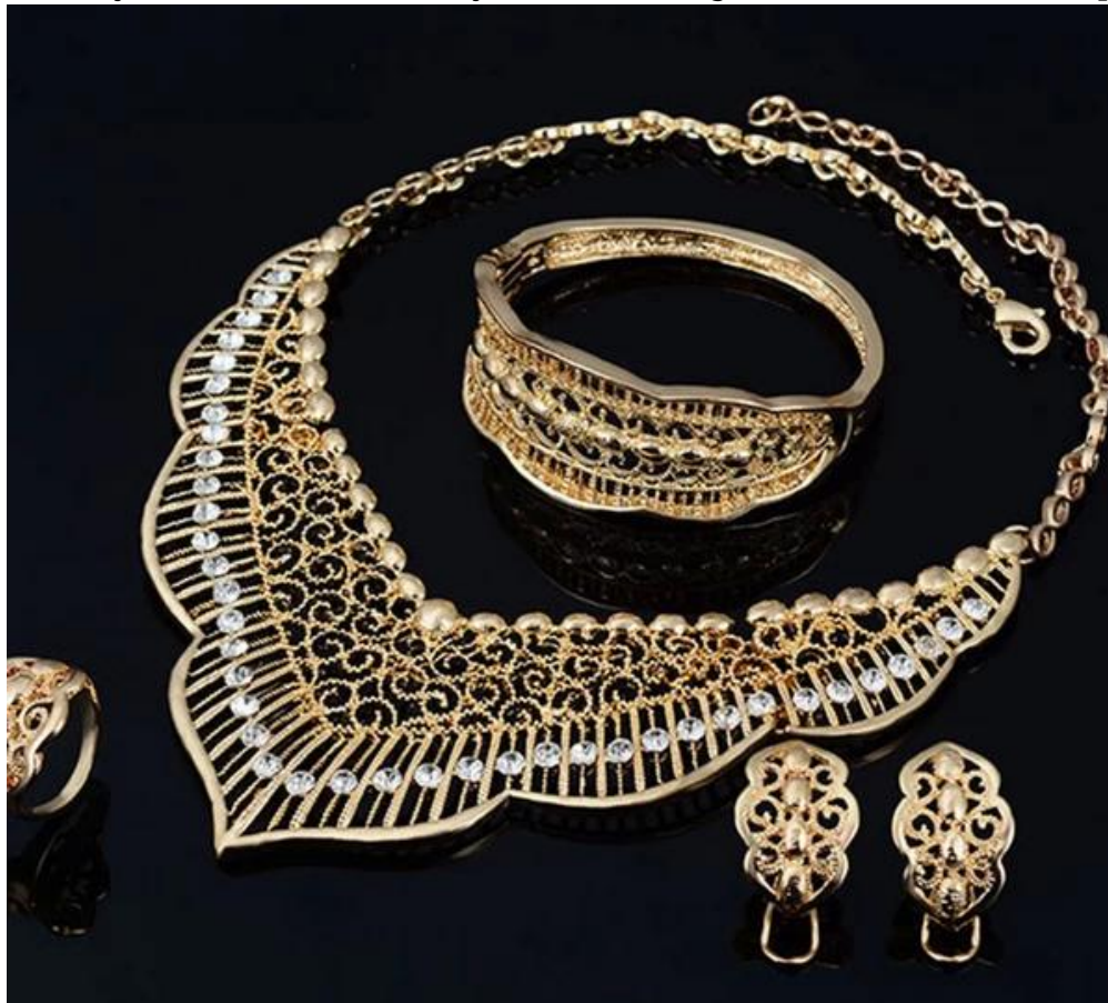
Factory Price Gold Love Alloy Gem Wedding Travel Women's Four-piece Jewelry Set