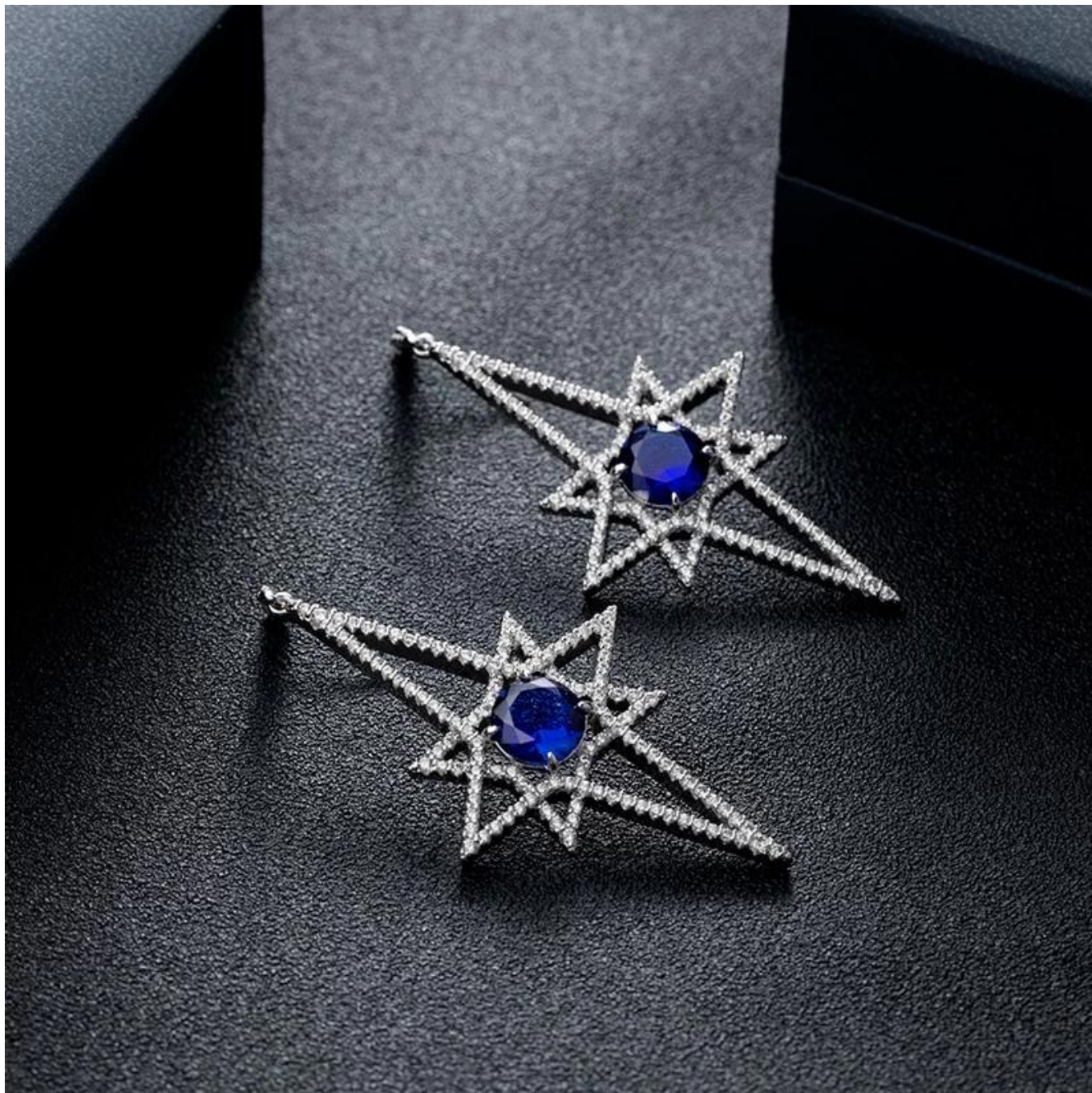
#Beautiful Stars Earrings .