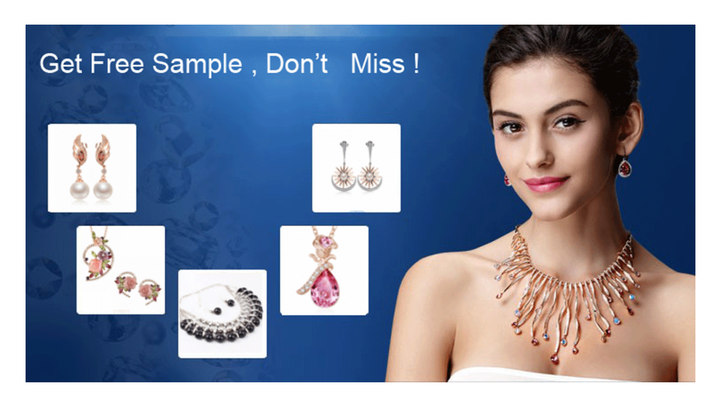
Fashion Jewelry European Bracelet for Women Colorful Alloy <u>Bracelet</u> <u>Christmas Jewelry Gift</u>

Alloy Bracelet with good quality and special design