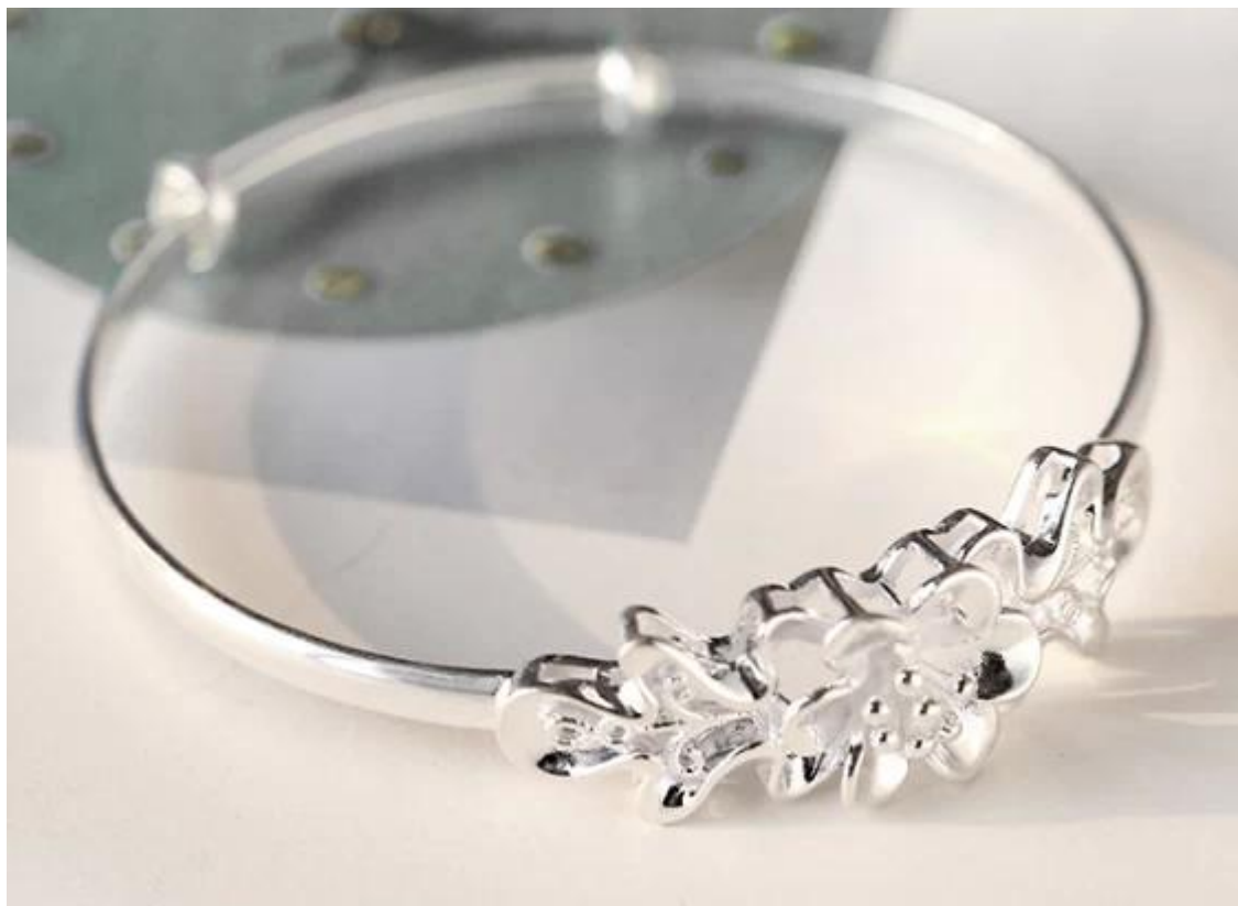
Fashion Silver Bracelet with Carve Flower for Woman Gift