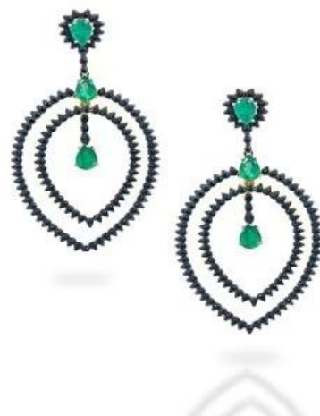
2017 new fashionable copper alloy charm earring design jewelry