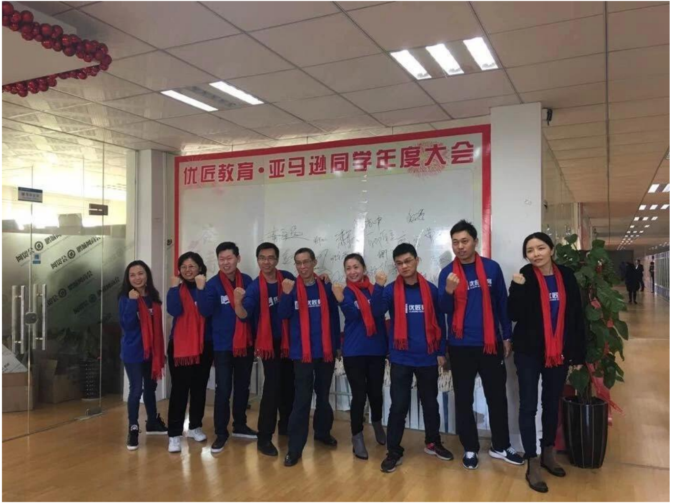
Excellent staff photo