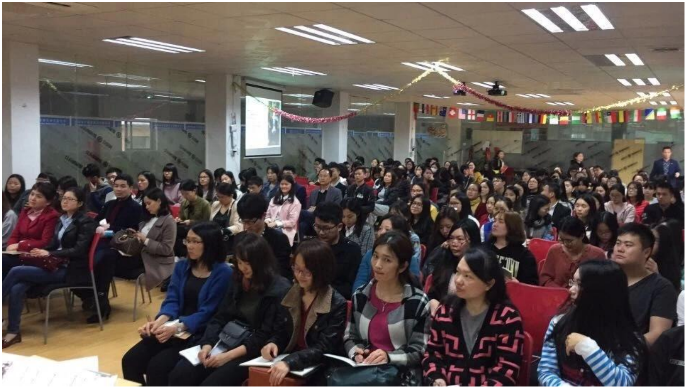
Office clerk temperament training