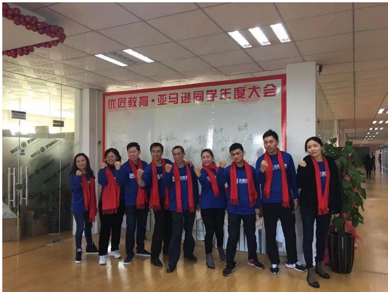
Excellent staff photo👍