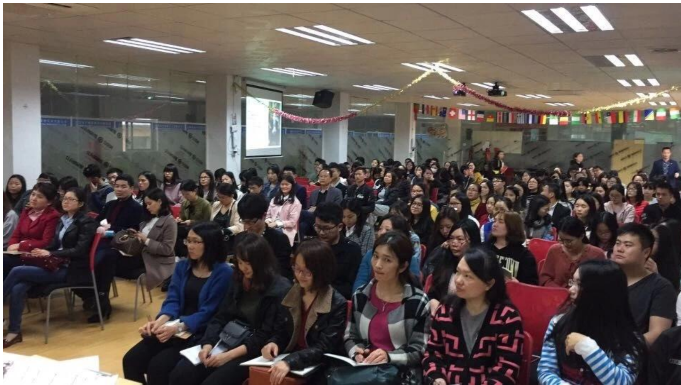
Office clerk temperament training