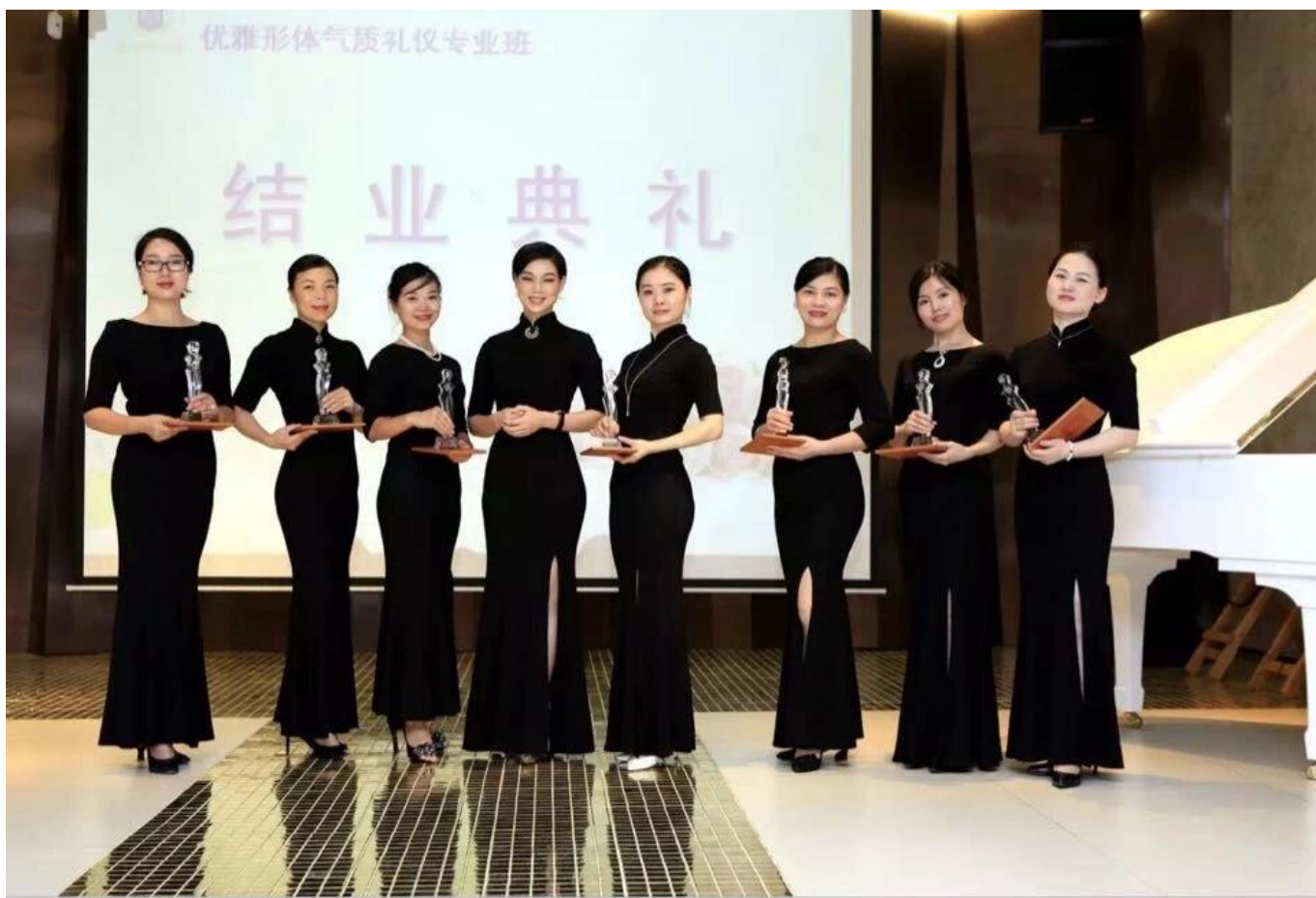
Amazon elite training