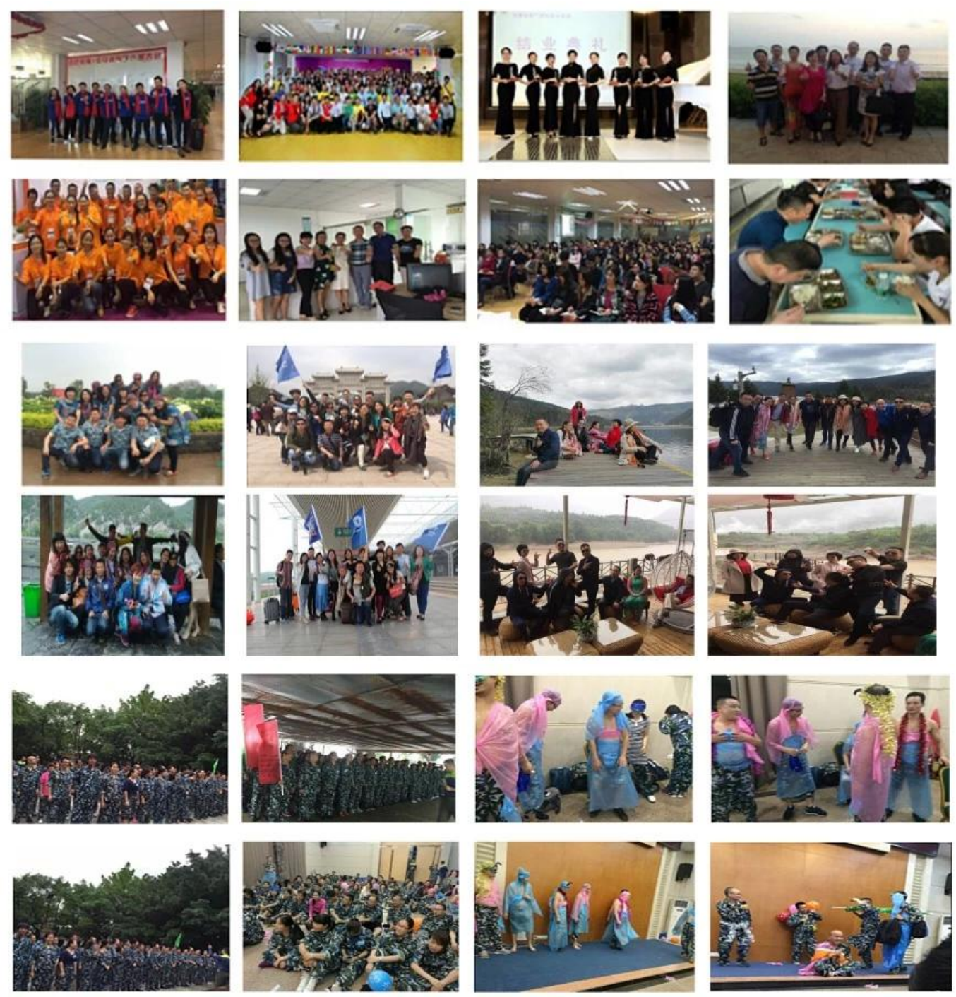
Dear Customers, What are you waiting for?

Our company is a professional manufacturer for the most fashionable jewelries. We sincerely treat every customer and we believe our delicate and high quality jewelry products will help your business go up faster and faster, better and better. Just contact us for more information by e-mail or phone.