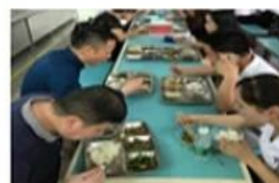
Factory workers military exercises and entertainment