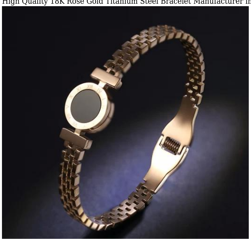
High Quality 18K Rose Gold Titanium Steel Bracelet Manufacturer in China