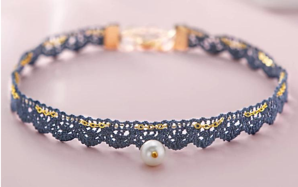
High Quality Manufacturer Zinc Alloy Lace Necklace with Artificial pearls pendant