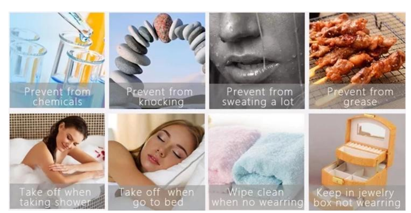
How to Match?