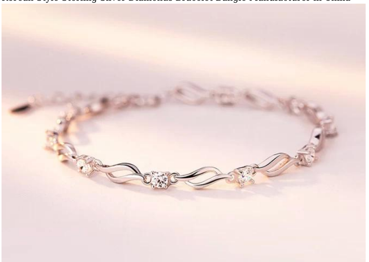
Korean Style Sterling Silver Diamonds Bracelet Bangle Manufacturer in China