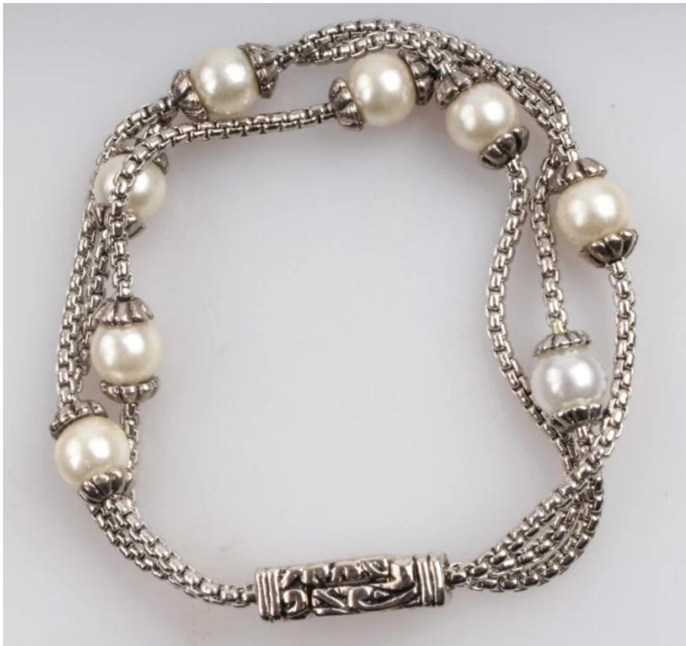
# Special Fashion Bracelet for Girls .