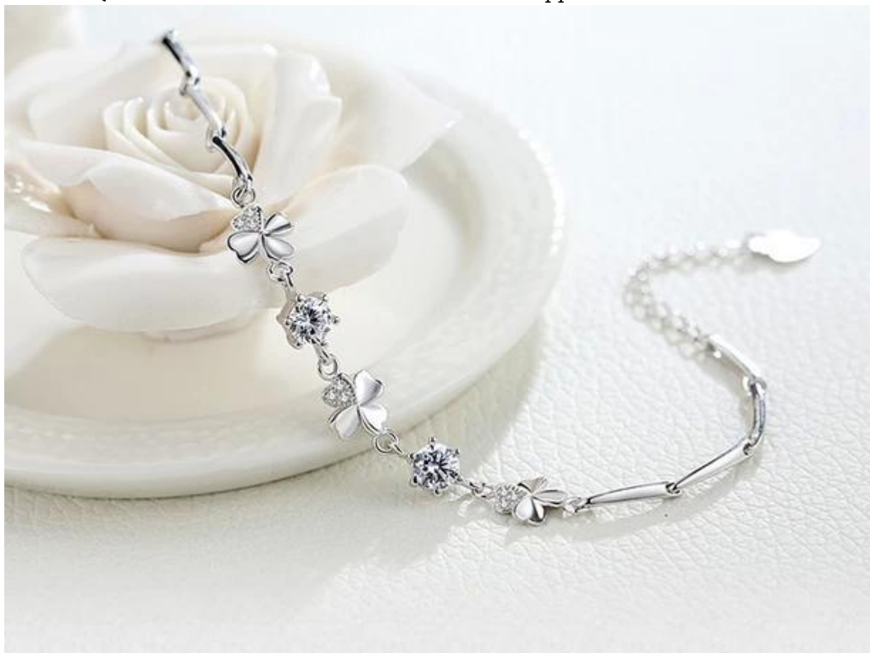
Low MOQ Woman 925 Silver Gemstone Bracelet Supplier from China