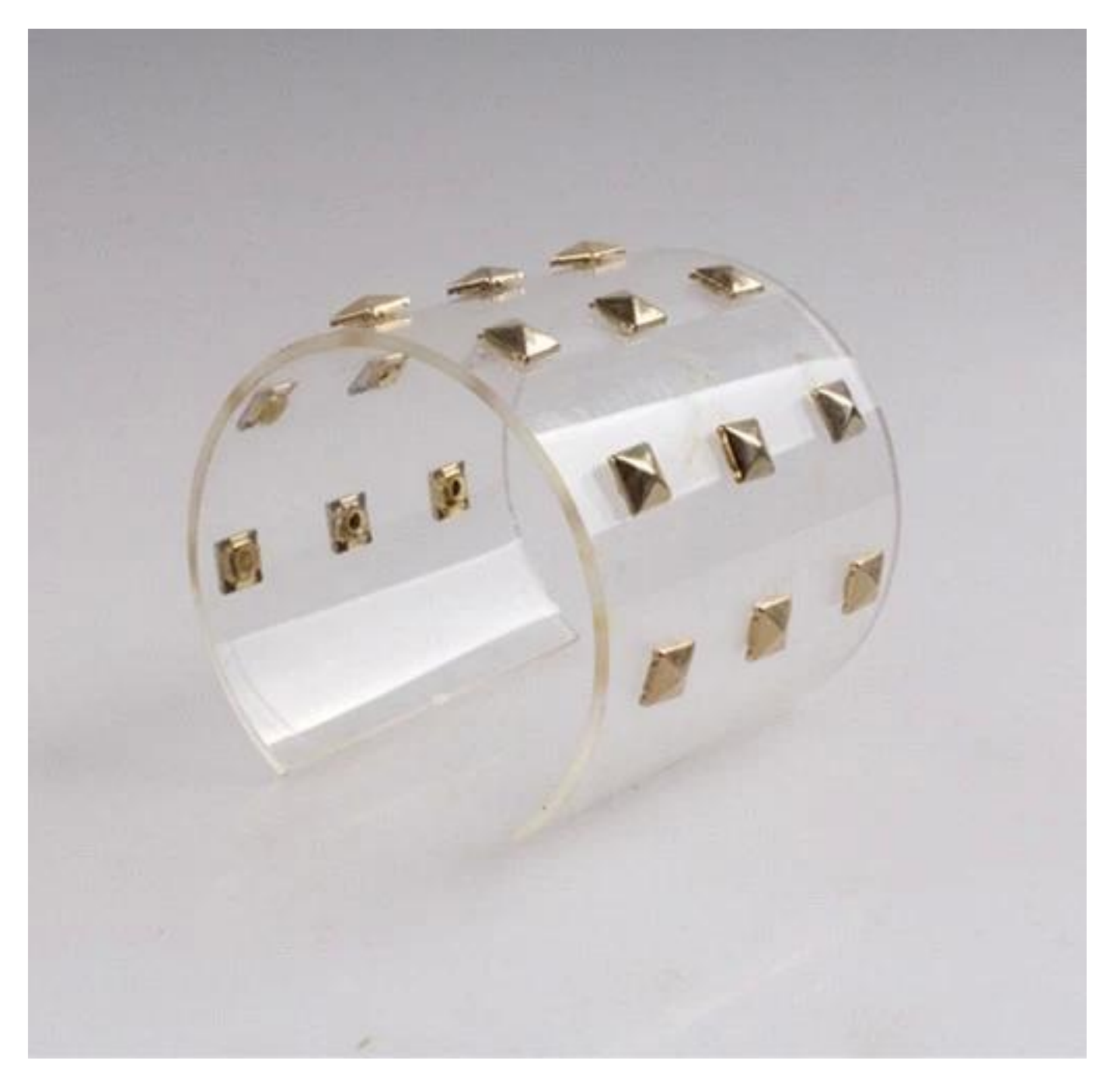
# Bracelet ,Necklace ,Earrings all can be support to customize.