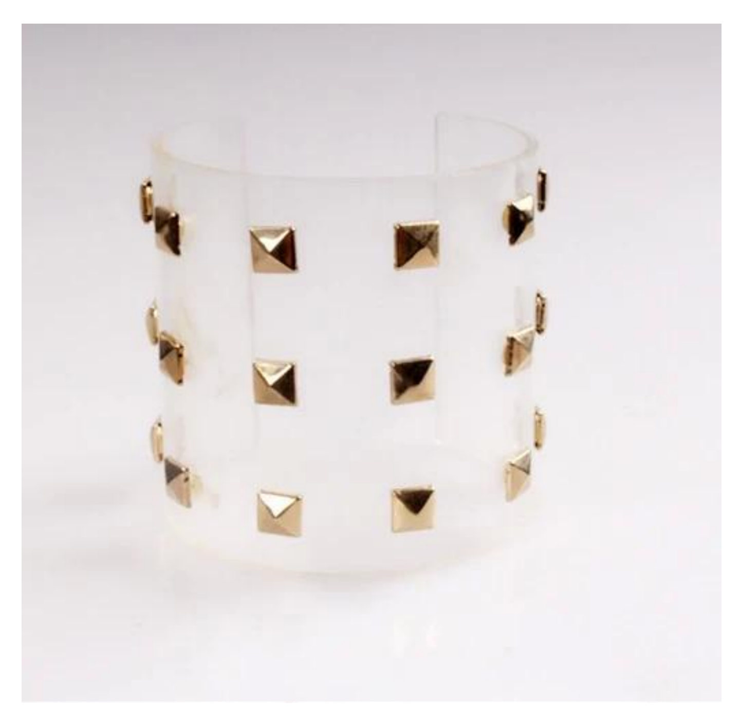
\mbox{\#} Welcome to take sample for check .