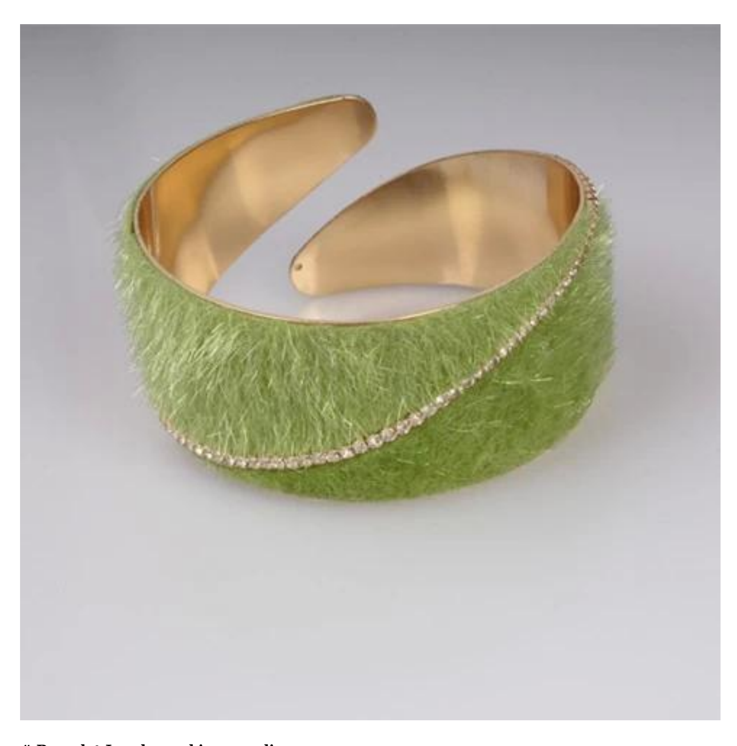
# Bracelet Jewelry making supplies.