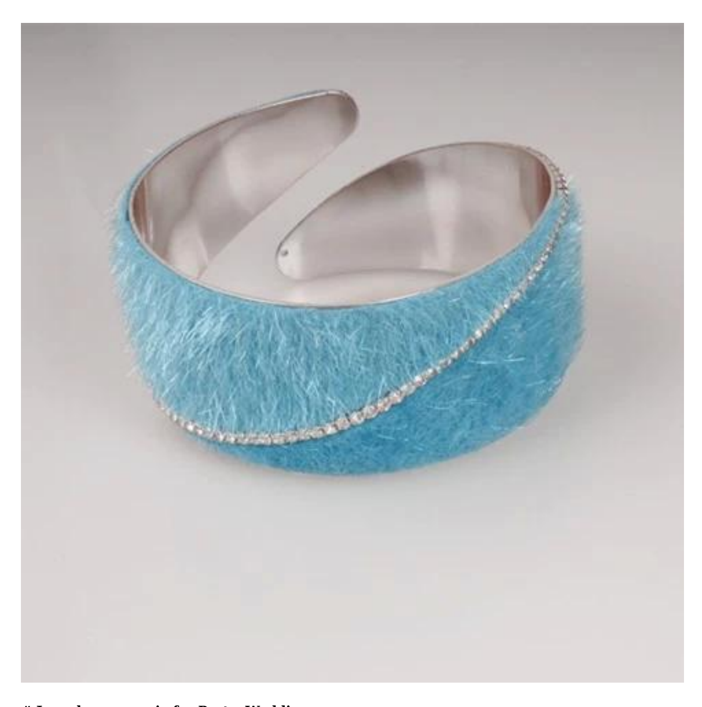
# Jewerly accessorie for Party, Wedding.