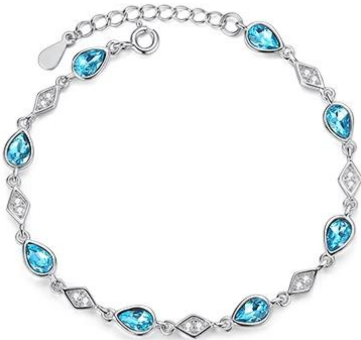
Professional Factory Blue Artificial Crystal S925 Beads Bracelet Bangle for Woman