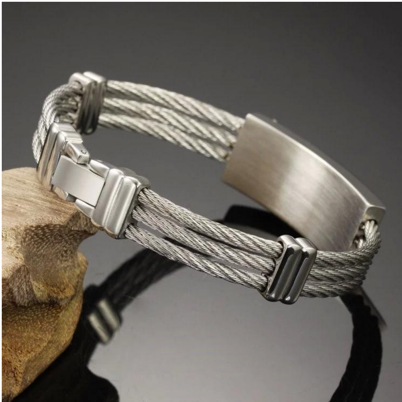
men's Stainless Steel Titanium bracelets jewelry golden, triple wire bangles bracelets for man with metal cross buckle