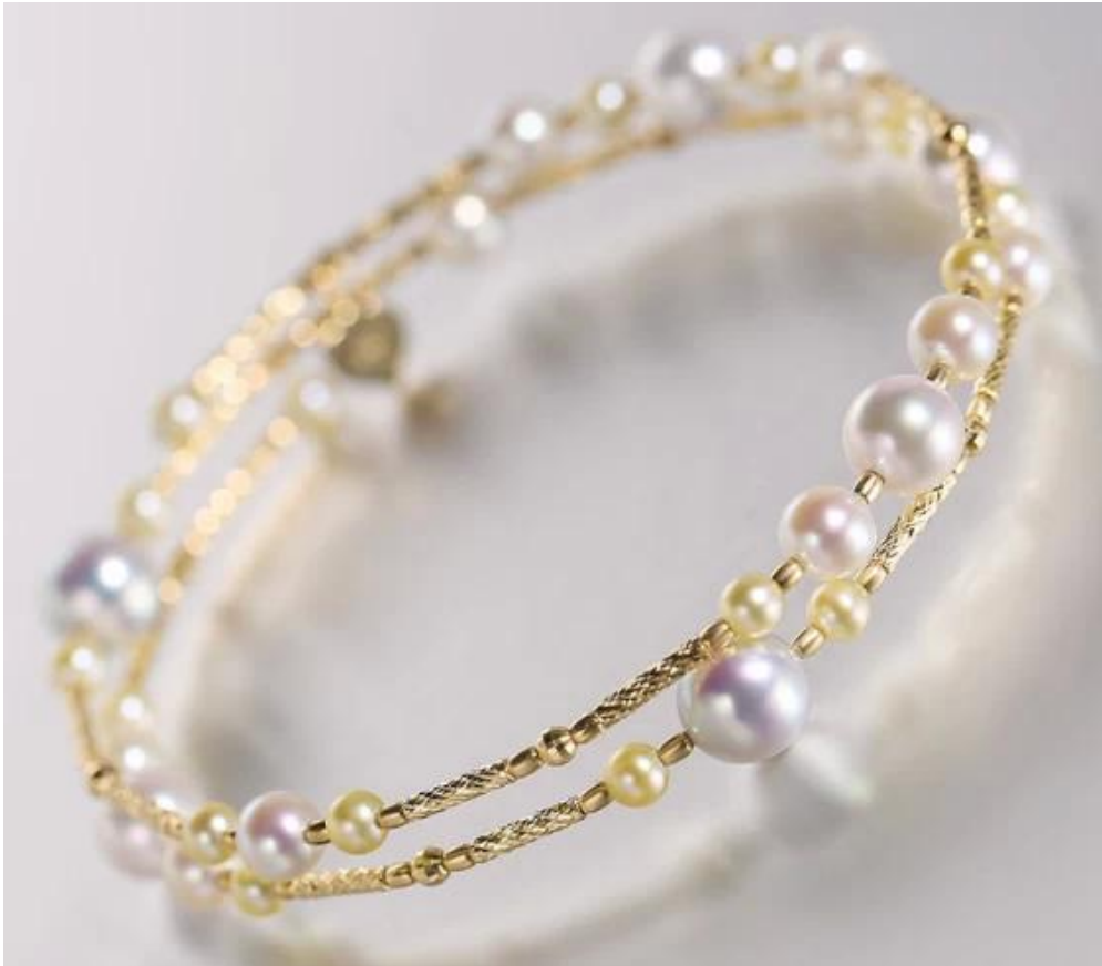
Wholesale Fashion 18K Rose Gold Plated Pearl Two Layers Chain Bracelet for Lady