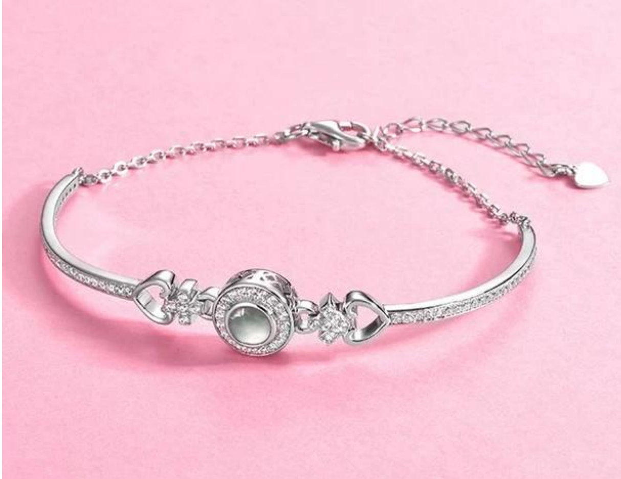
Woman Bracelet Bangle 20cm Length 925 Sliver Gemstone Bracelet Supplier China