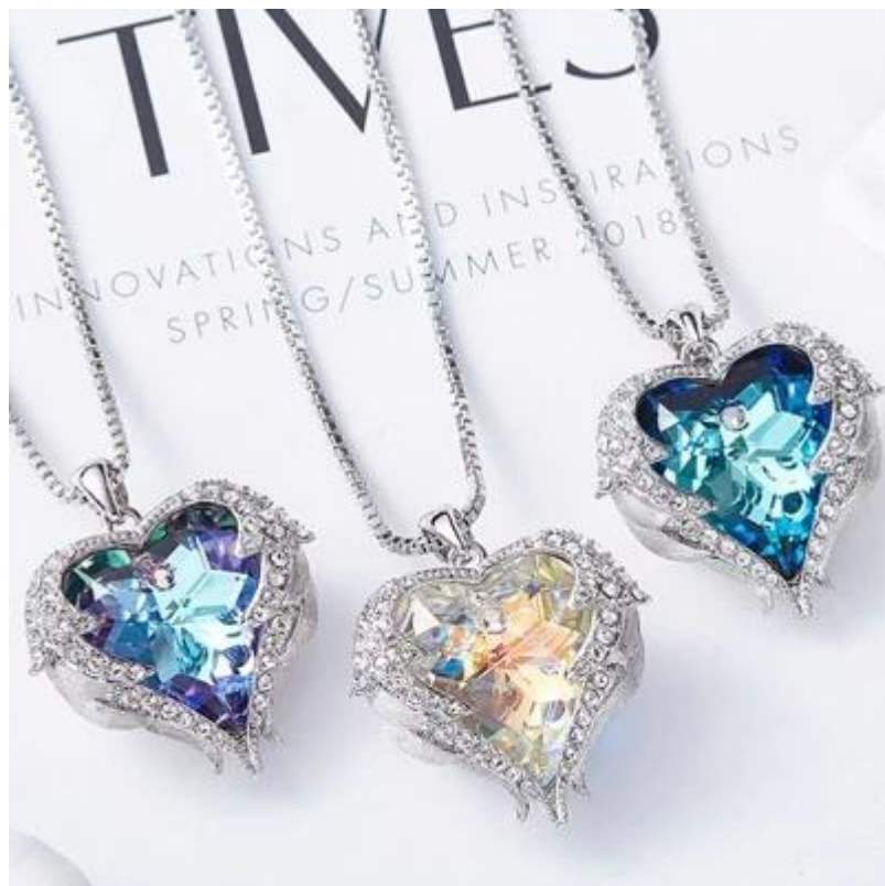
Cute blue diamond heart of the sea pendant initial necklace bridal crystal jewelry